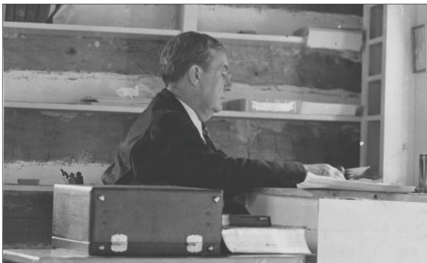
Anderson in his studio at Ripshin