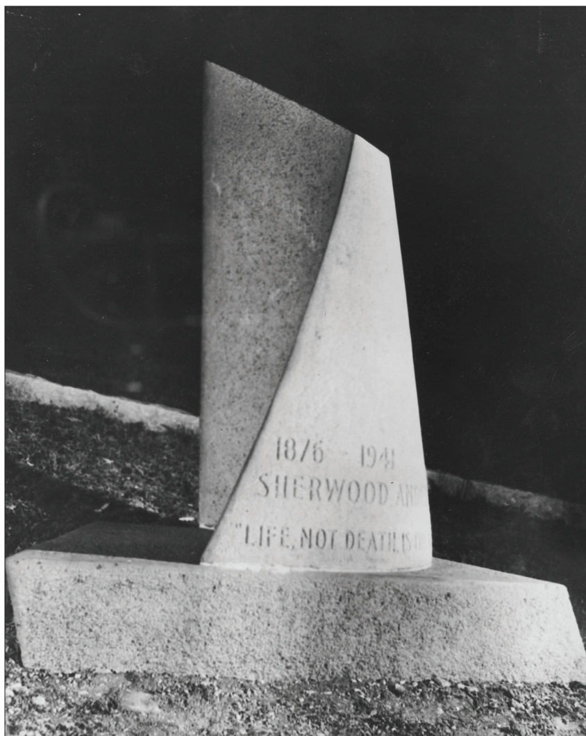
Wharton Esherick's abstract sculpture marks Anderson's grave in Round Hill Cemetery, Marion. It bears an epitaph that is also the final sentence of his memoirs: "LIFE, NOT DEATH, IS THE GREAT ADVENTURE."