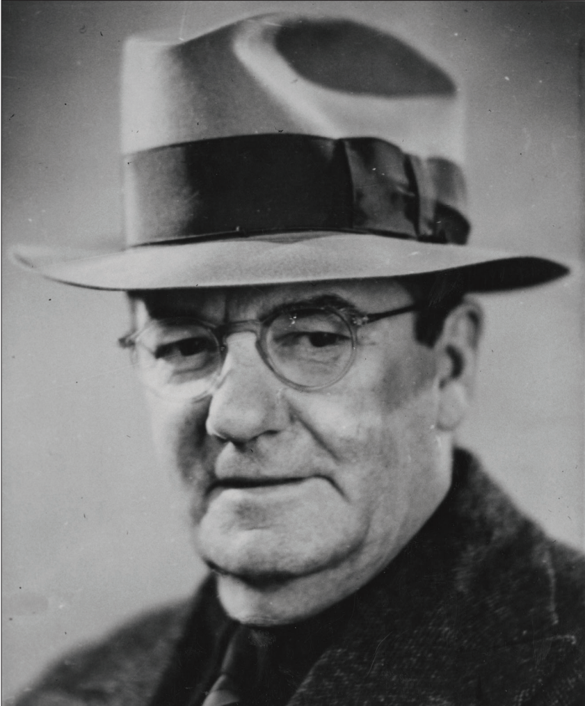
Sherwood Anderson as the people of Marion knew him. At the time of his death, this likeness was published in the two Marion weeklies that Anderson had once owned.