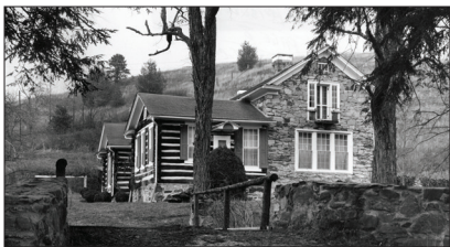
Anderson's country house, Ripshin, near Troutdale, Virginia