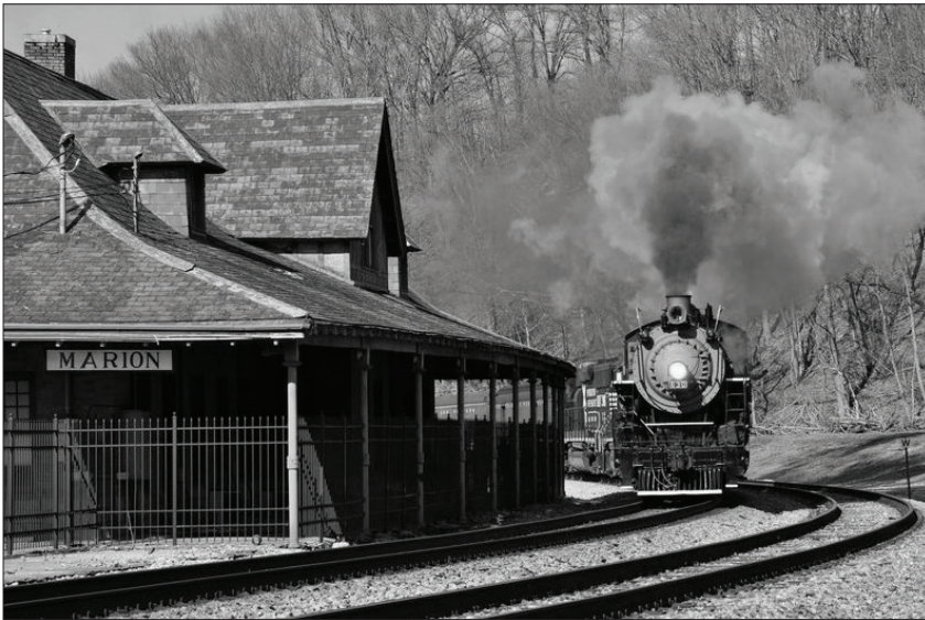
Marion railroad station