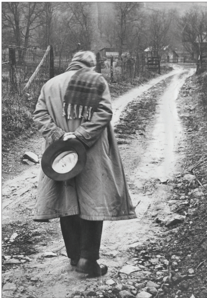
Anderson on the road near Ripshin, January 3, 1941. One of many photographs taken that day by a photographer from Life magazine. The feature article for which they were intended was never published.